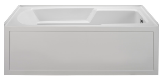
Front view of the integral skirt.